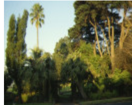
1 footscray park ballarat road footcra y palms