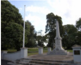
KOROIT BOTANIC GARDENS SOHE 2008