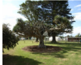
KOROIT BOTANIC GARDENS SOHE 2008