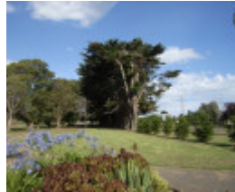
KOROIT BOTANIC GARDENS SOHE 2008