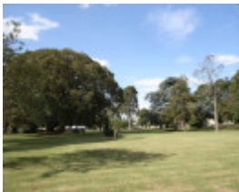
KOROIT BOTANIC GARDENS SOHE 2008