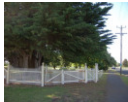
KOROIT BOTANIC GARDENS SOHE 2008