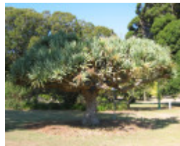
H0118 Koroit Botanic Gardens 11