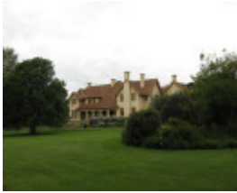
Mawallok 1908 house