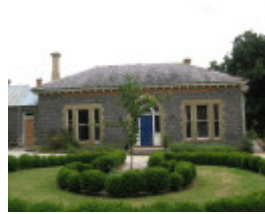
Mawallok Old homestead