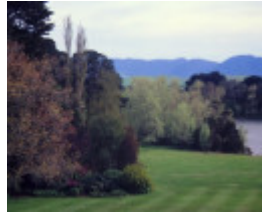
Mawallok view mt cole