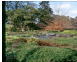
h02052 burnley gardens sept 03