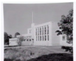
h02052 admin building 1949 slv