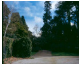
h02052 burnley gardens trees 2 sept 03