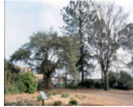
h02052 burnley gardens trees sept 03