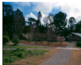
h02052 burnley gardens view from field station to ornamental gdns sept 03