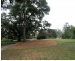
BURNLEY GARDENS SOHE 2008