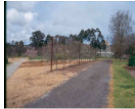
h02052 burnley gardens field station 2 sept 03