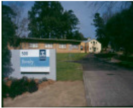
h02052 burnely gardens yarra boul entrance sept 03