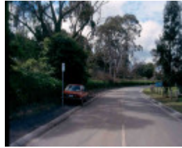
h02052 burnely gardens south boundary 2 sept 2003