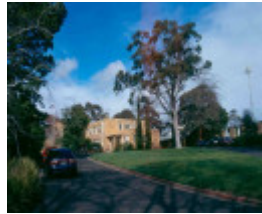
h02052 burnley gardens former admin building sept 03