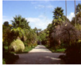
1 williamstown botanic gardens palm avenue ac2 apr1999