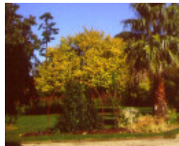
williamstown botanic gardens golden elm lawn ac2 apr1999