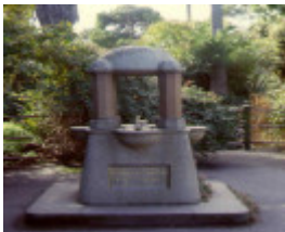
williamstown botanic gardens drinking fountain ac2 apr1999