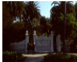
williamstown botanic gardens entrance gates ac2 apr1999