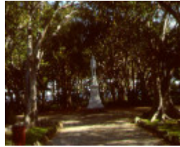
williamstown botanic gardens at clarke statue ac2 apr1999