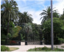
WILLIAMSTOWN BOTANIC GARDENS SOHE 2008