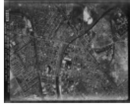
royal park camp pell 1942 W.jpg