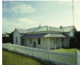
cape otway lightstation residence aug1996