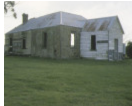
1 former holy trinity anglican church school merrawarp road ceres front view