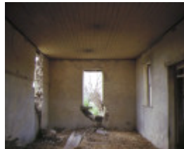
former holy trinity anglican church school merrawarp road seres interior