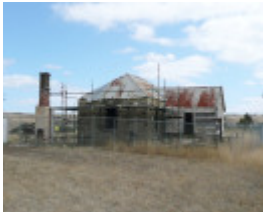
FORMER HOLY TRINITY ANGLICAN CHURCH SCHOOL SOHE 2008