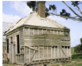
former holy trinity anglican church school merrawarp road ceres rear of wooden building