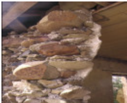
former holy trinity anglican church school merrawarp road ceres detail of stone wall