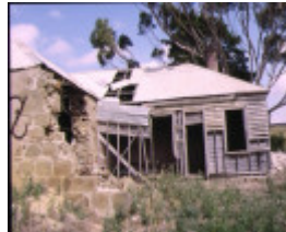
former holy trinity anglican church school merrawarp road cees side view mar1993