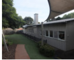
RCK rear elevation.jpg