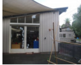
RCK rear playroom doors to playground.jpg