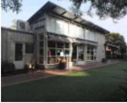
RCK north east facade.jpg