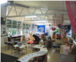
RCK rear playroom interior view.jpg