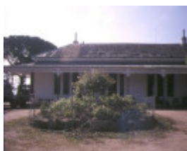
1 mt rothwell homestead little river ripley road little river front elevation apr1995