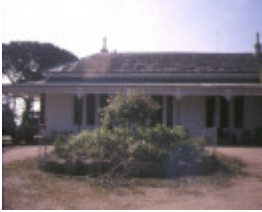
1 mt rothwell homestead little river ripley road little river front elevation apr1995