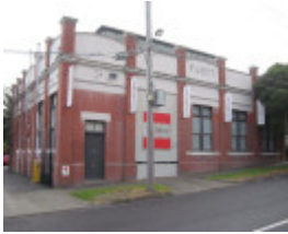
Former Elsternwick Substation