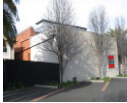
Elsternwick substation rear view