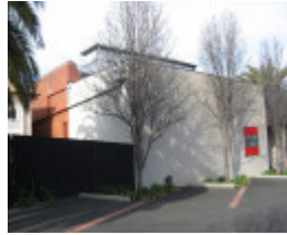
Elsternwick substation rear view