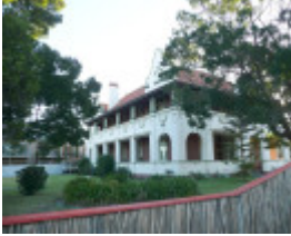
ASHBY PRESBYTERY OF ST PETER AND ST PAUL SOHE 2008