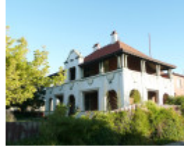
ASHBY PRESBYTERY OF ST PETER AND ST PAUL SOHE 2008