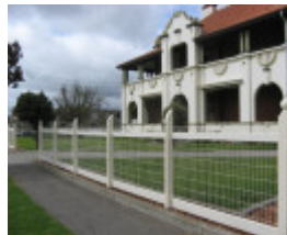
Miscellaneous photos Oct 2010 037.jpg