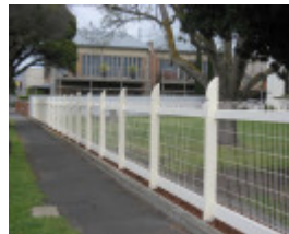
Miscellaneous photos Oct 2010 034.jpg