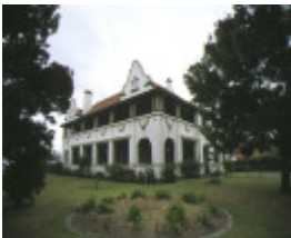
1 ashby presbytery of st peter & st paul geelong side view apr1997