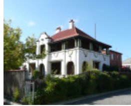
ASHBY PRESBYTERY OF ST PETER AND ST PAUL SOHE 2008