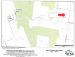
Warby Falls, Dams Weir & Race