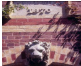
belleville ryrie street geelong carving front door she project 2004