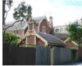
BELLEVILLE SOHE 2008