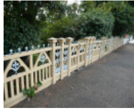
BELLEVILLE SOHE 2008