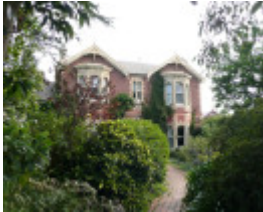
BELLEVILLE SOHE 2008