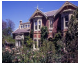
h01188 1 belleville ryrie street geelong front view she project 2004