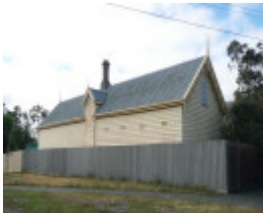
BELLEVILLE SOHE 2008