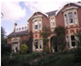
h01188 bellville ryrie street geelong front view aug1995