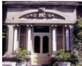
belleville ryrie street geelong front door billiard room she project 2004