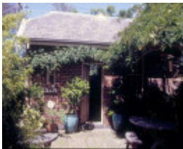
belleville ryrie street geelong fback stables she project 2004