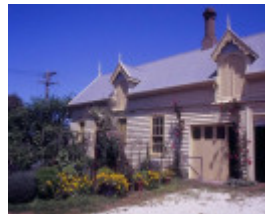
belleville ryrie street geelong stables she project 2004