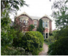
BELLEVILLE SOHE 2008