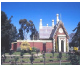
eastern cemetery gatehouse ormond road geelong garden she project 2003