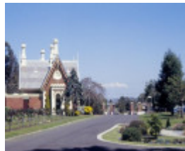
eastern cemetery gatehouse ormond road geelong driveway she project 2003