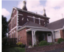
fernshaw western beach geelong rear view aug1995