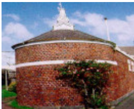
fernshaw western beach geelong rounded wall of stable publication