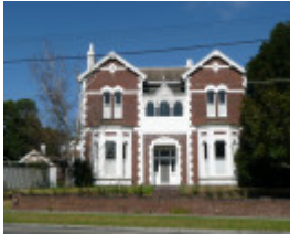
FERNSHAW SOHE 2008