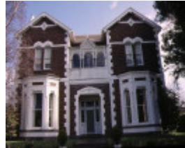
1 fernshaw western beach geelong front view aug1995