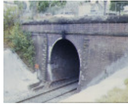
1 railway tunnel geelong colac line geelong front view apr1997