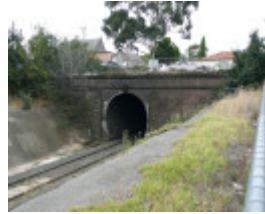
RAILWAY TUNNEL SOHE 2008