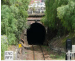
RAILWAY TUNNEL SOHE 2008