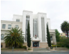
GORDON TECHNICAL COLLEGE SOHE 2008