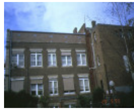
Gordon Technical College Geelong Side Windows November 1995