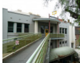
GORDON TECHNICAL COLLEGE SOHE 2008