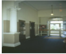
Gordon Technical College Geelong Interior Entrance August 1995