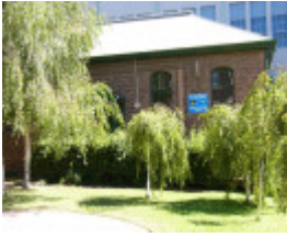
h01019 gordon technical college fenwick street geelong bldgf1 chemical laboratory she project 2004