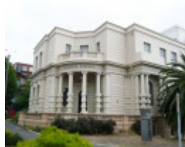
GORDON TECHNICAL COLLEGE SOHE 2008