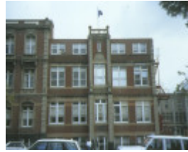
Gordon Technical College Geelong Front Elevation August 1995