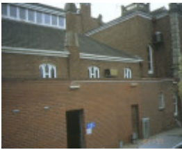
Gordon Technical College Geelong Rear View August 1995