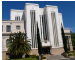
h01019 gordon technical college fenwick street geelong bldg t1 textile college she project 2004