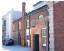
h01019 gordon technical college fenwick street geelong bldgd1 davidson hall she project 2004