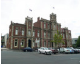
GORDON TECHNICAL COLLEGE SOHE 2008