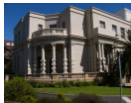
h01019 gordon technical college fenwick street geelong bldgc and bostock memorial she project 2004