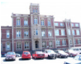
h01019 gordon technical college fenwick street geelong bldga administration bldg she project 2004