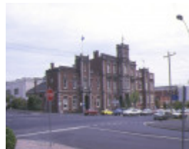
1 gordon technical college geelong front view dec1993