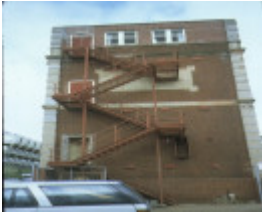
Gordon Technical College Geelong Exterior Staircase August 1995