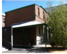
h01019 gordon technical college fenwick street geelong bldgf2 plumbing carpentry art modelling she project 2004