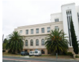
GORDON TECHNICAL COLLEGE SOHE 2008