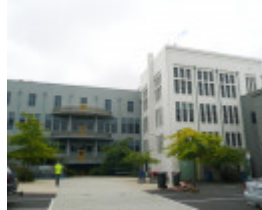
GORDON TECHNICAL COLLEGE SOHE 2008