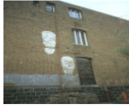
Gordon Technical College Geelong Bluestone Base August 1995