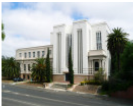
GORDON TECHNICAL COLLEGE SOHE 2008