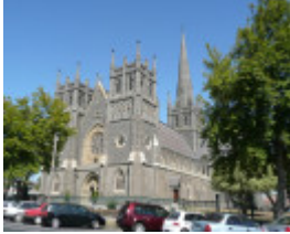
ST MARY OF THE ANGELS CATHOLIC CHURCH SOHE 2008