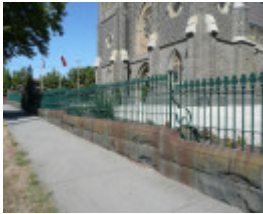
ST MARY OF THE ANGELS CATHOLIC CHURCH SOHE 2008