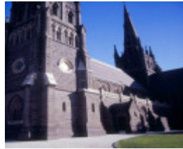
h01026 st mary of the angels catholic church yarra street geelong church exterioro she project 2003