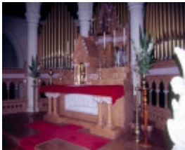
h01026 st mary of the angels catholic church yarra street geelong high altar she project 2003