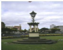
1 belcher drinking fountain geelong front view