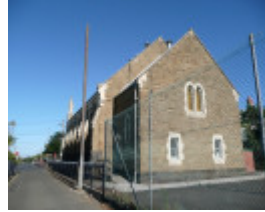
FORMER NEWTOWN METHODIST CHURCH SOHE 2008