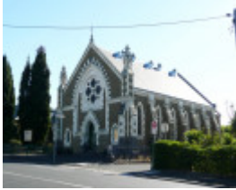
FORMER NEWTOWN METHODIST CHURCH SOHE 2008