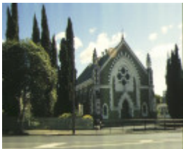
1 former newtown methodist church pakington street geelong front view aug1995