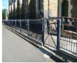
FORMER NEWTOWN METHODIST CHURCH SOHE 2008