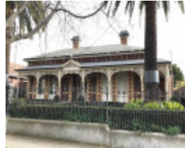
39 Clarence Street, Malvern East