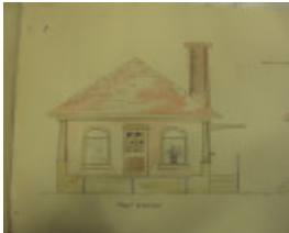
1930 drawing showing the front elevation of the dairy