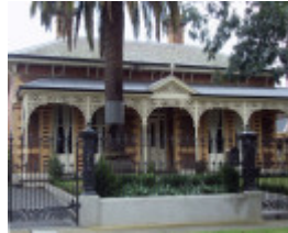
Residence at 39 Clarence Street