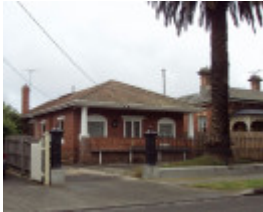
Former Malvern Dairy