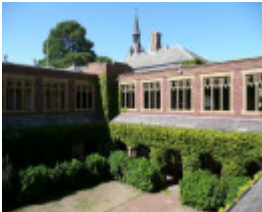
GEELONG COLLEGE SOHE 2008