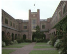
1 geelong college talbot street newtown cloisters nov1990