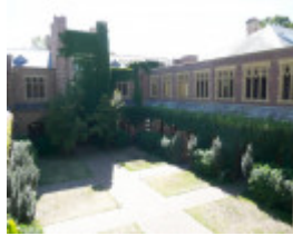
GEELONG COLLEGE SOHE 2008