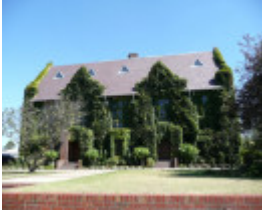
GEELONG COLLEGE SOHE 2008