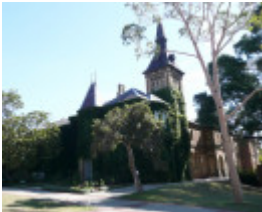
GEELONG COLLEGE SOHE 2008