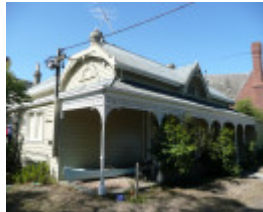
GEELONG COLLEGE SOHE 2008