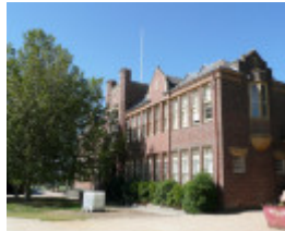
GEELONG COLLEGE SOHE 2008