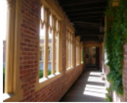
GEELONG COLLEGE SOHE 2008