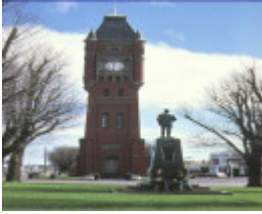
finlay ave of elms precinct camperdown view of clock tower