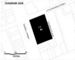
total car park plan.jpg