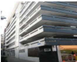
Total House laneway side