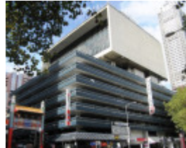
Total House Russell St view