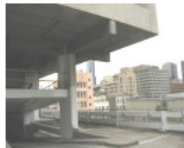
Total House office supports