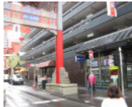
Total House Little Bourke St shops