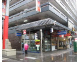
Total House corner shops