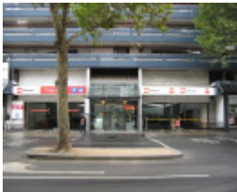
Total House Russell St entrance