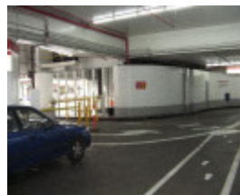
Total House ground level interior