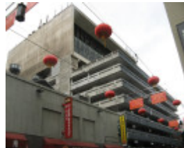
Total House view from Little Bourke