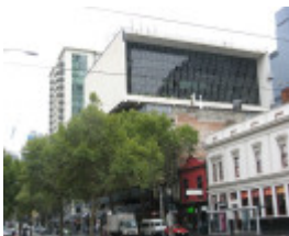
Total House view from south