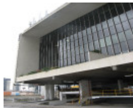
Total House office structure