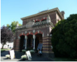
CAMPERDOWN COURT HOUSE SOHE 2008