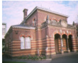
camperdown court house front elevation