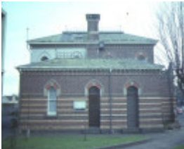
camperdown court house rear view jul1984