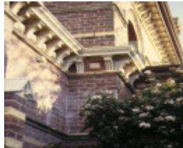
camperdown court house facade detail sep1997