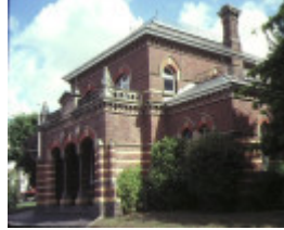
1 camperdown court house front view apr1984