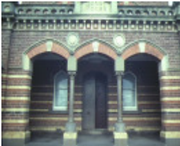
camperdown court house entrance jul1984