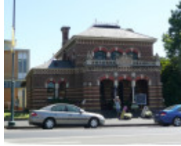
CAMPERDOWN COURT HOUSE SOHE 2008