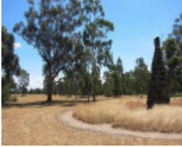
rp The Burke & Wills monument and the nearby natural landscape