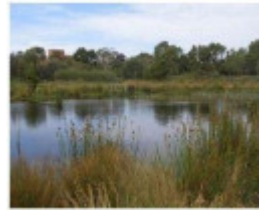
rp ross straw baseball field