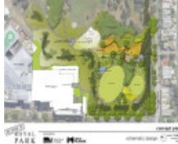
return to royal park concept plan.jpg