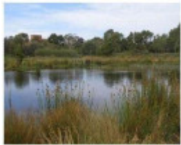
rp Tree planting alongside tramway through Golf Course.jpg