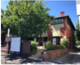
274 High Street, Windsor (2).jpeg