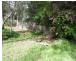
Brisbane St drain d