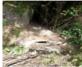
Brisbane St drain a