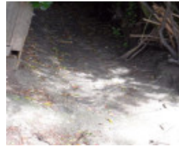
Brisbane St drain b