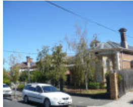
Sydenham Street precinct