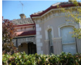
Sydenham Street precinct