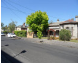
Sydenham St 1-9.JPG