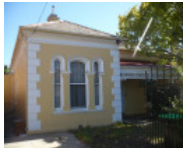
Sydenham Street precinct