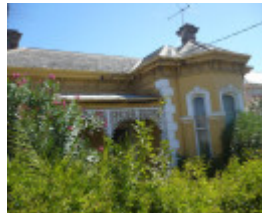
Sydenham Street precinct