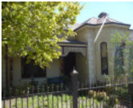
Sydenham Street precinct