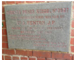
Moonee Ponds Primary School