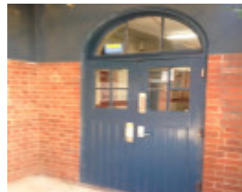
Moonee Ponds Primary School