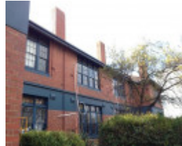
Moonee Ponds Primary School