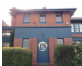
Moonee Ponds Primary School