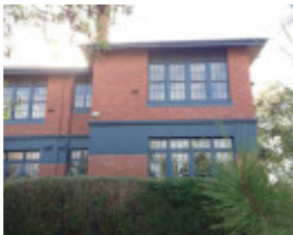
Moonee Ponds Primary School