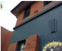
Moonee Ponds Primary School