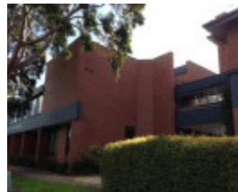
Moonee Ponds Primary School