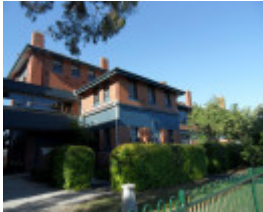
Moonee Ponds Primary School