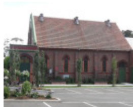
Essendon Baptist Church