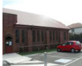
Essendon Baptist Sunday School