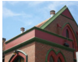
Essendon Baptist Church