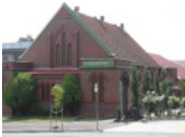
Essendon Baptist Church