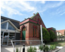
Essendon Baptist Church