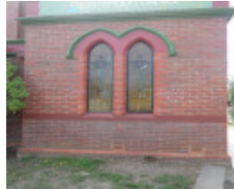
Essendon Baptist Church