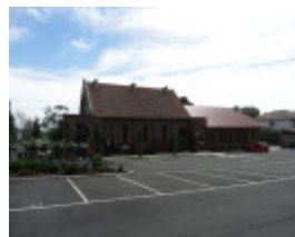
Essendon Baptist Church