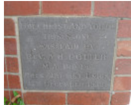
Essendon Baptist Church