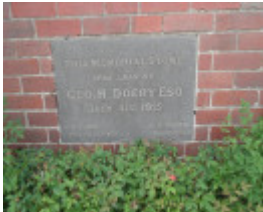
Essendon Baptist Church