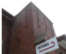
Essendon Baptist Church