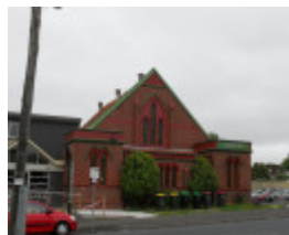
Buckley St 124.JPG