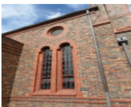
St Therese's Church