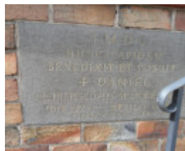
St Therese's Church