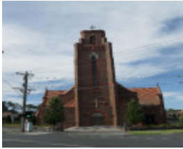
St Therese's Church