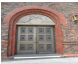
St Therese's Church