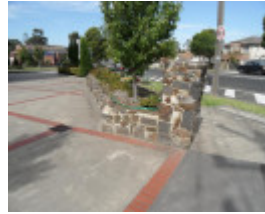
St Therese's Church