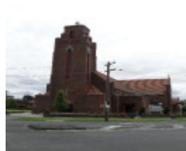
Lincoln Rd 48A.JPG