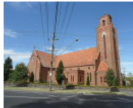
St Therese's Church