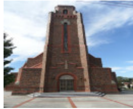
St Therese's Church