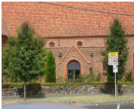
St Therese's Church