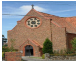
St Therese's Church