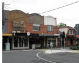
Buckley St 123-131.JPG