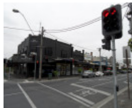
Rose St a.JPG