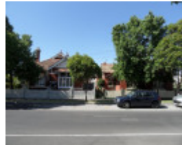
31-33 Taylor Street