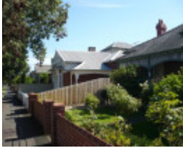
Margaret Street and Park Street