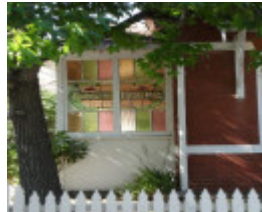
31 Taylor Street