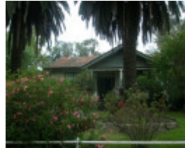
Residence in 2012