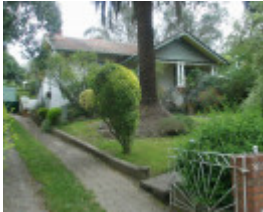
Residence in 2012