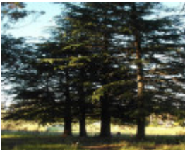
T11219 Quercus robur c