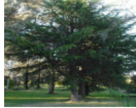
T12219 Quercus robur a