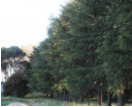
T12219 Quercus robur