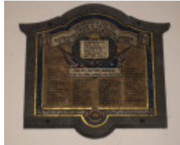
Armadale Baptist Church, Honour Roll, Brooks, Robinson & Co. 1920