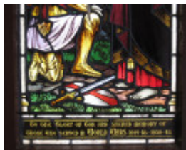
Kaniva Presbyterian Church Crown of Life BR&Co 1948 inscription