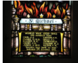
Castlemaine Uniting Church