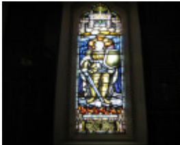
Castlemaine Uniting Church WWII