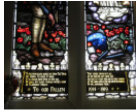
Castlemaine Uniting Church