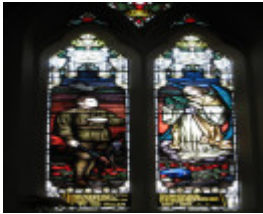
Castlemaine Uniting Church