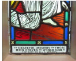
Sandringham All Souls Anglican Ferguson&Papas inscription