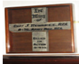
Snake Valley Carngham Uniting Church Russell cross