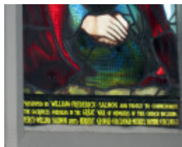
North Essendon Christ Church Anglican Ascension