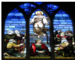
North Essendon Christ Church Anglican Ascension