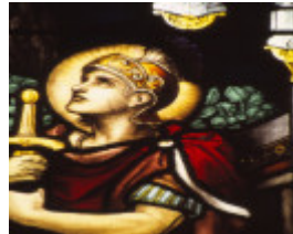
Murchison Christ Church Anglican St George detail B&Co