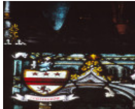
Hawthorn Christ Church St George BR&Co detail 1919