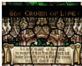
Newtown Geelong Pakington Methodist Crown of Life inscription 1949