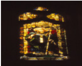
Hawthorn Church of Immac Conception St Patrick 1922