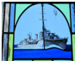
Crib Point HMAS Cerberus Anglican Chapel Tribal Class Destroyers (3)