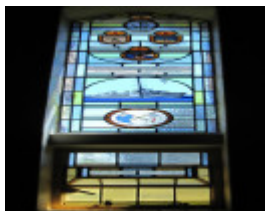
Crib Point HMAS Cerberus Anglican Chapel Tribal Class Destroyers (1)