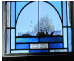
Crib Point HMAS Cerberus Anglican Chapel Sloops (3)