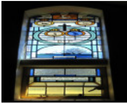
Crib Point HMAS Cerberus Anglican Chapel Sloops (1)